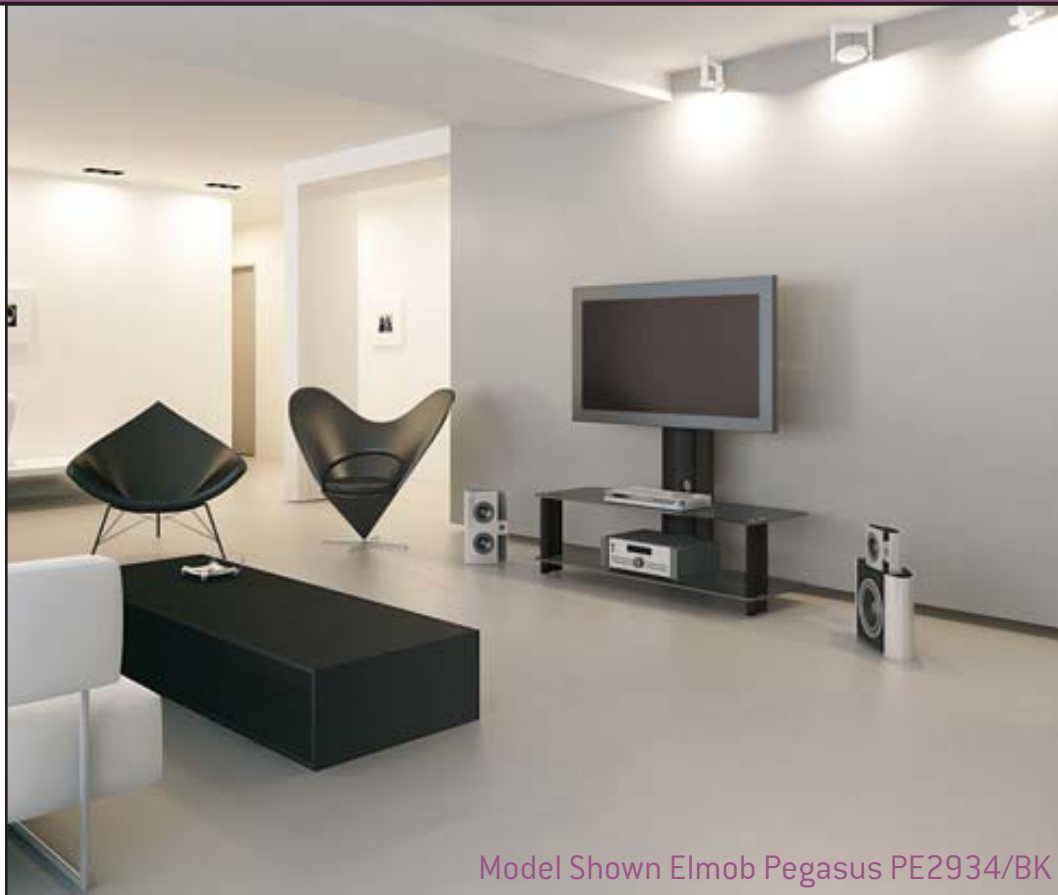
Model Shown Elmob Pegasus PE2934/BK